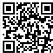
User Manual e-Request