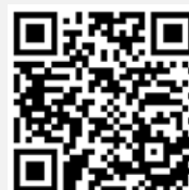
User Manual e-Voting

* Note Operation of the electronic conferencing system and Inventech Connect systems. Check internet of shareholder or proxy include equipment and/or program that can use for best performance. Please use equipment and/or program as the follows to use systems.